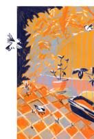
Garden Birds Giclée Print 130 x 180 mm 2020 Framed | Signed print (Limited edition of 20) £40