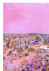
Desert Drive Gouache & pencil on paper 100 x 150 mm 2019 Framed | Original artwork (Unique - signed on reverse) £175