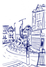
Park Road Junction Pencil on paper 130 x 180 mm 2020 Framed | Original artwork (Unique - signed on reverse) £80