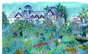
Secret Garden Watercolour & pencil on paper 180 x 130 mm 2019 Framed | Original artwork (Unique - signed on reverse) £175