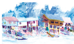
Riverside Huts Watercolour & pencil on paper 297 x 210 mm 2019 Framed | Original artwork (Unique - signed on reverse) £235