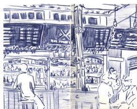
George & Vulture Pencil on paper 250 x 200 mm 2019 Framed | Original artwork (Unique - signed on reverse) £115