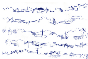
Train Journey Pencil on paper 297 x 210 mm 2019 Framed | Original artwork (Unique - signed in corner) £130