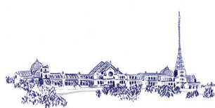
Alexandra Palace (Far) Pencil on paper 297 x 210 mm 2020 Framed | Original artwork (Unique - signed on reverse) £115