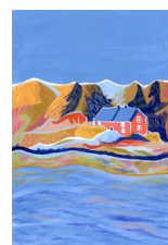
Red Cabin, Stockholm Giclée Print 100 x 150 mm 2020 Framed | Signed print (Limited edition of 20) £35