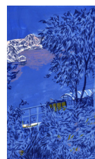
Blue Lagoon Gouache & pencil on paper 100 x 150 mm 2019 Framed | Original artwork (Unique - signed on reverse) £175