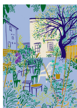
St John's Grove Giclée Print 300 x 420 mm 2020 Framed | Signed print (Limited edition of 20) £95