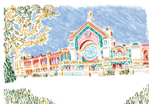
Alexandra Palace (Near) Pencil on paper 297 x 210 mm 2020 Framed | Original artwork (Unique - signed on reverse) £130